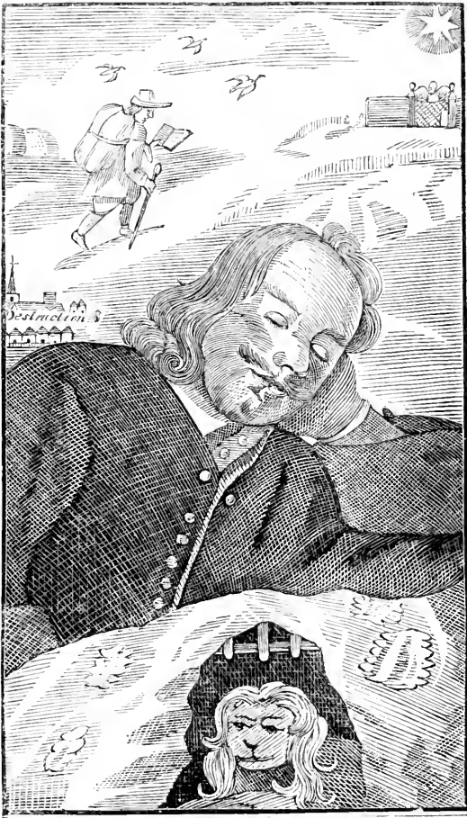
The first and second editions have no Portrait of the Author : the third has an engraved Portrait by White. This Cut is copied from the seventh edition.